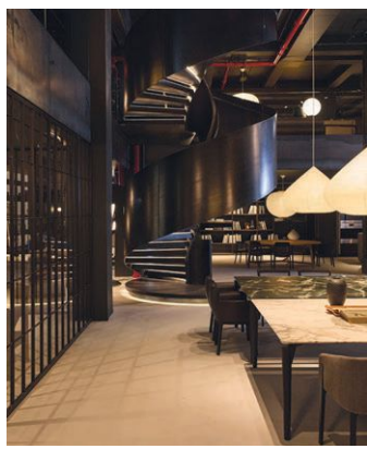
Clockwise from top: Etëline features top French artists and iconic design pieces; Boffi|DePadova's showroom is an interior inspiration; the radiant exterior of Boffi|DePadova's latest showroom.