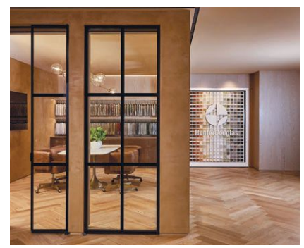
Skyline Window Coverings opens its seventh showroom at the iconic DDB | Decoration and Design Building.